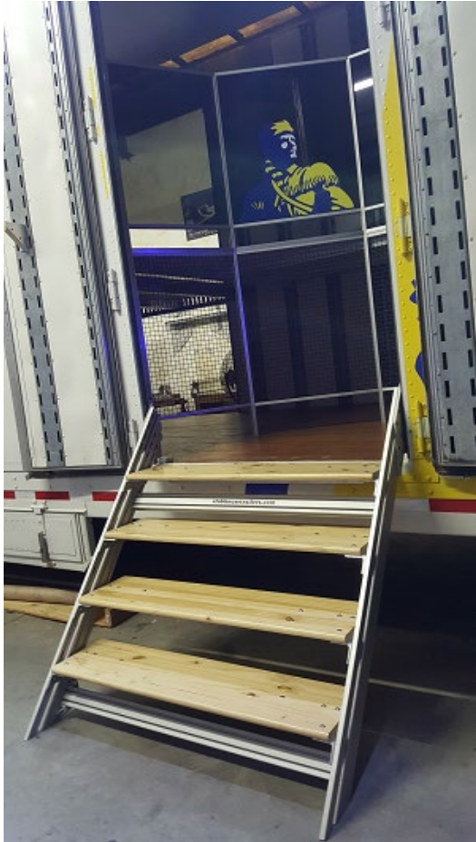
Entry and Stair Systems