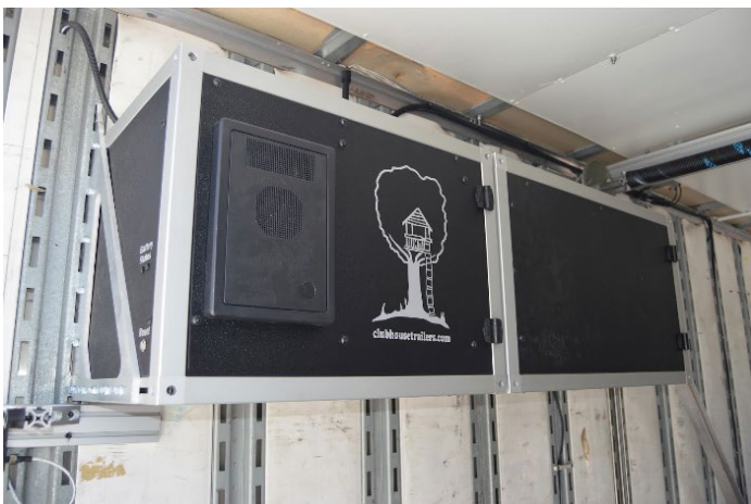
12-Volt Power Systems and LED Lighting