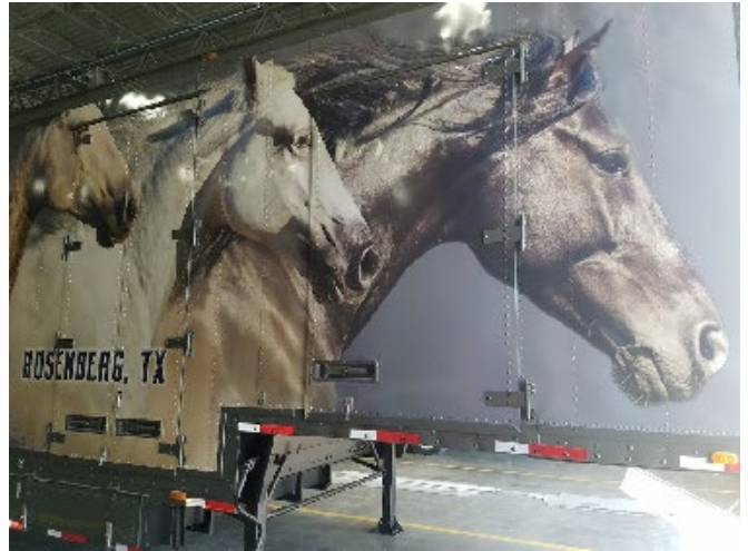
High Quality Digitally Printed Graphics