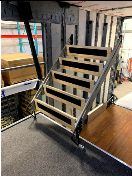
Retracting Interior Stairs